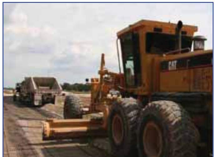
Photo 2: Belly dump spread over geogrids